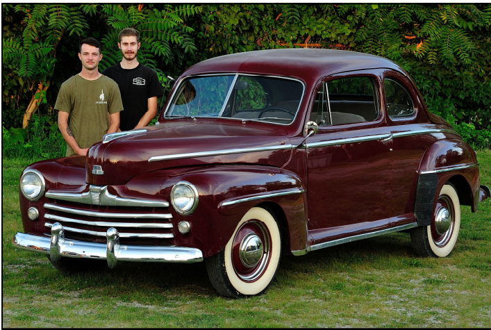
John McCollough and Scott Armstrong with the 1948 Ford Rookie Team Great Race Car prior to the 2022 race preparation.

The Great Race is an international event and will involve 120 teams from around the world. It is a 9-day time-and-distance rally — not a conventional high speed race. It will involve precise navigation and superior driving skills on 2,200 miles of back roads across America. In addition our youth will need to troubleshoot any problems that arise with the cars and repair them themselves en route.