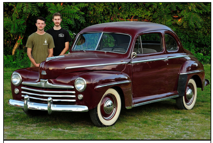
John McCollough and Scott Armstrong with the 1948 Ford Rookie Team Great Race Car prior to the 2022 race preparation.

The Great Race is an international event and will involve 120 teams from around the world. It is a 9-day time-and-distance rally — not a conventional high speed race. It will involve precise navigation and superior driving skills on 2,200 miles of back roads across America. In addition our youth will need to troubleshoot any problems that arise with the cars and repair them themselves en route.