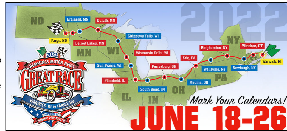
More info about the Great Race can be found at: greatrace.com

You can follow their progress during the race on social media and by going to museumcrew.com on the internet. This internet site will not be available until the race.